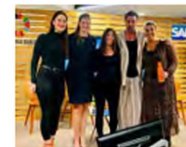
TECH & SUSTAINABILITY