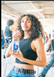
SMART WATER @smartwater

SEASON1 - March/April SEASON2 - Sept/Oct/Nov