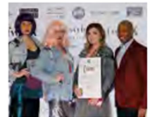
BK STYLE MUSE AWARDS PRESS CONFERENCE