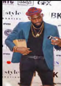
SAINT NEW YORK @saintnewyork