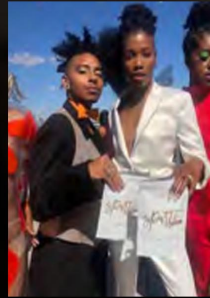
SPARTI SCENTS @spartiscents