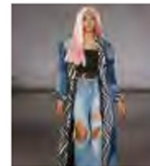
DENIM NIGHT OUT